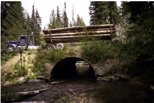
Forest and Fish Agreement