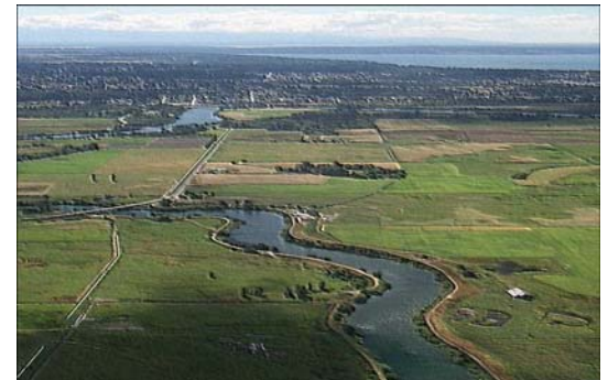
2514 Watershed Planning