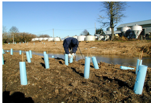
GMA and CAO's