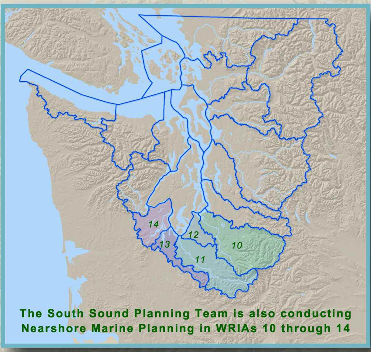
The South Sound Planning Team is also conducting Nearshore Marine Planning in WRIs 10 through 14